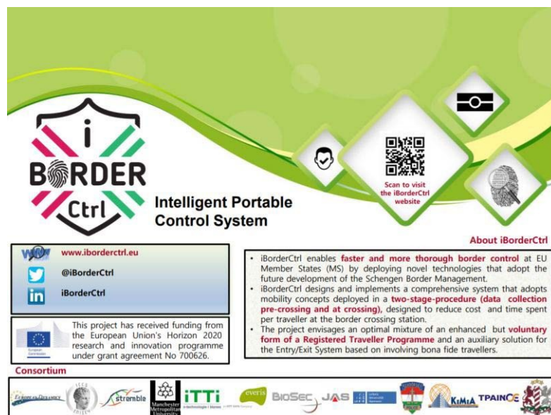
Figure 4 Project leaflet 1/2

For the purposes of dissemination activities at numerous events, iBorderCtrl leaflet has been designed in order to be distributed to end users and stakeholders interested in the proposed system for land border crossing points and its integral components. The leaflet is presented in Figure 4 and Figure 5.