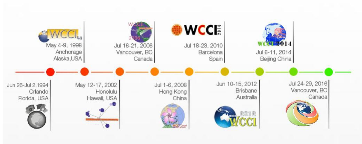
Figure 1 History of IEEE WCCI

To address these challenges multi-disciplinary research needs to be carried out in order to develop comprehensive systems to be designed and implemented which can provide automated computationally intelligence platforms. Recent research examples focused on the land border control include disciplines in the areas of: analysis of the traveller’s non-verbal behaviour, analytics of document authenticity, discovery of key patterns through data-mining and machine learning for border control analytics, hidden human detection to confront illegal immigration, advanced algorithms, big data, artificial intelligence and neural networks along with face, fingerprints and palm vein biometric models. These are just some key examples of how scientific disciplines can be combined together to enable automatic risk assessment enabling reliable decision making at border control points which respect an individual’s privacy whilst maintaining data security.