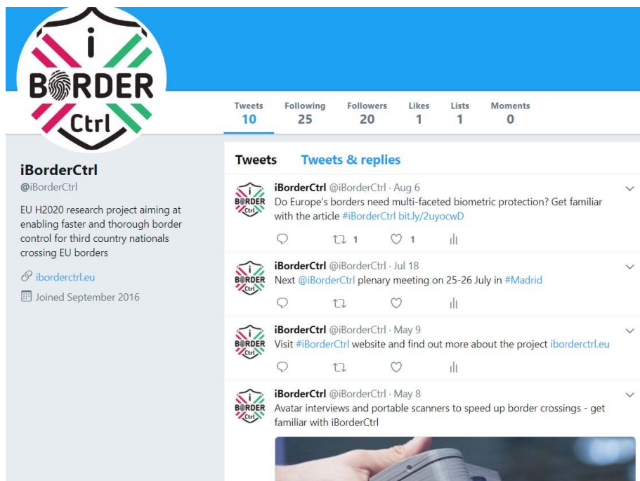
Figure 7 iBorderCtrl Twitter profile

At the onset of the project, consortium members created iBorderCtrl social media accounts on Twitter and LinkedIn. The profiles have been used to publish minor updates and short news related to the project. Though preliminary the profiles gathered a number of followers and members, the recent change of the project name resulted in the necessity to rename the social media profiles (which in fact required setting them up from scratch). Therefore, at the moment, the iBorderCtrl Twitter account has gathered 23 followers.